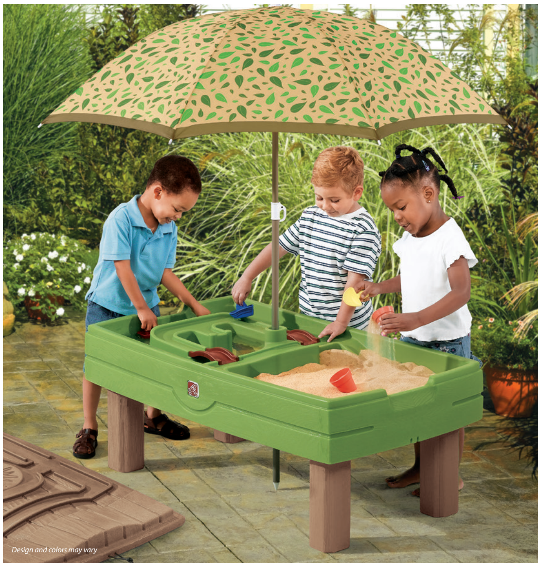
Design and colors may vary