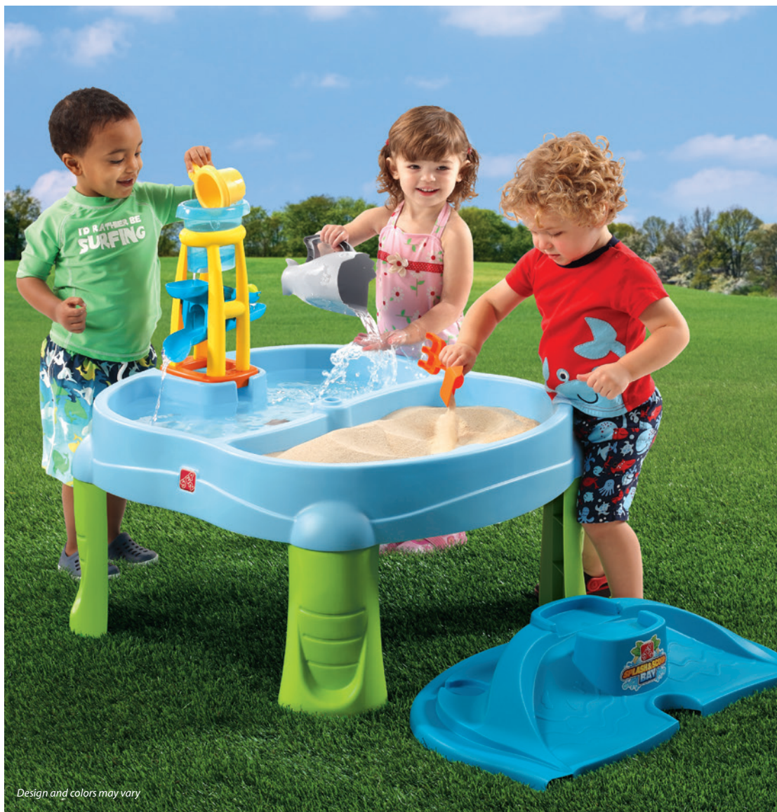
Design and colors may vary